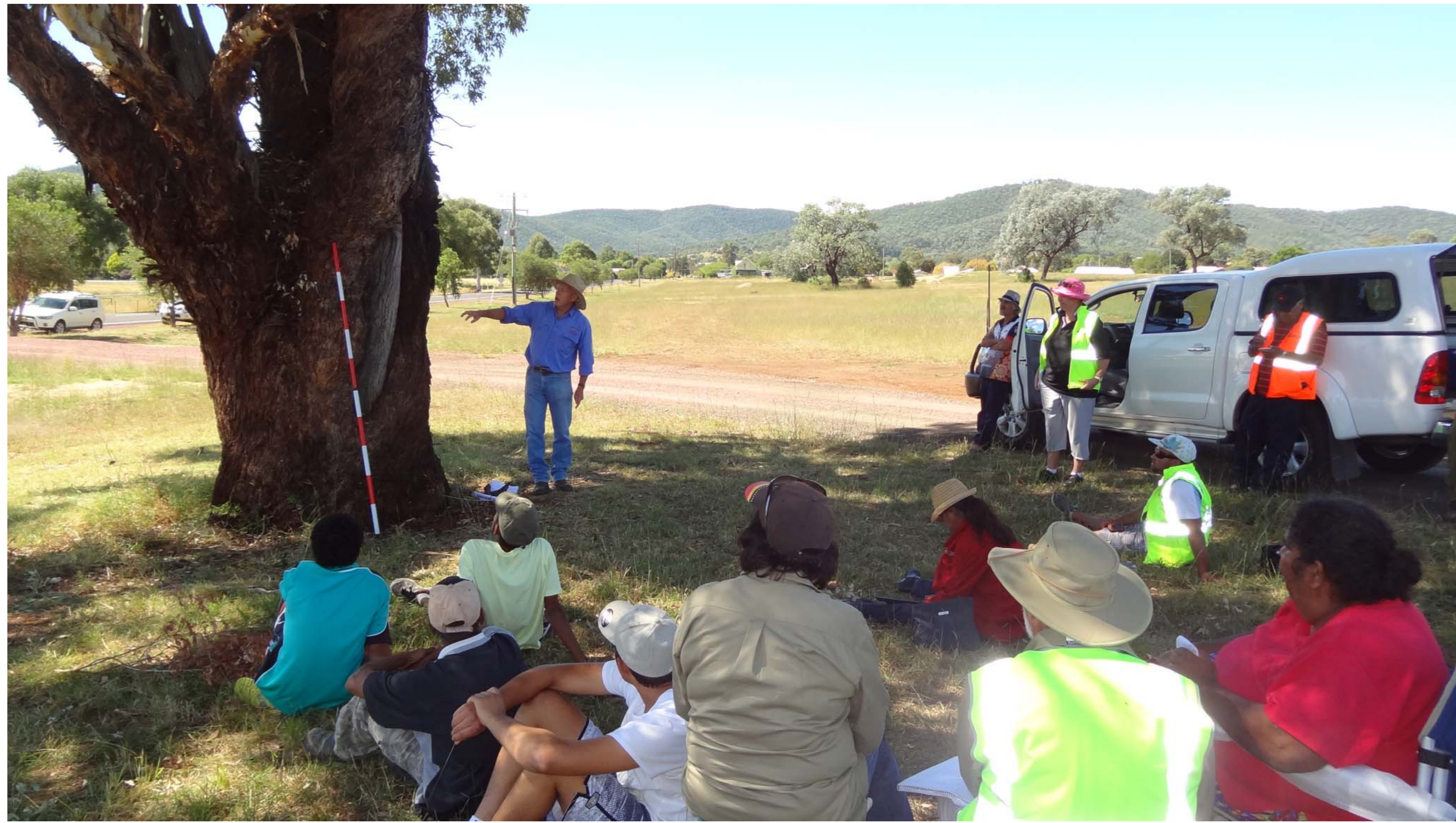
Elders and young people learning skills relating to the identification of traditional aboriginal markings and artifacts.

The final weekend is yet to be held, but some preliminary work was achieved with the aboriginal heritage archeological forum held at TLC in April.