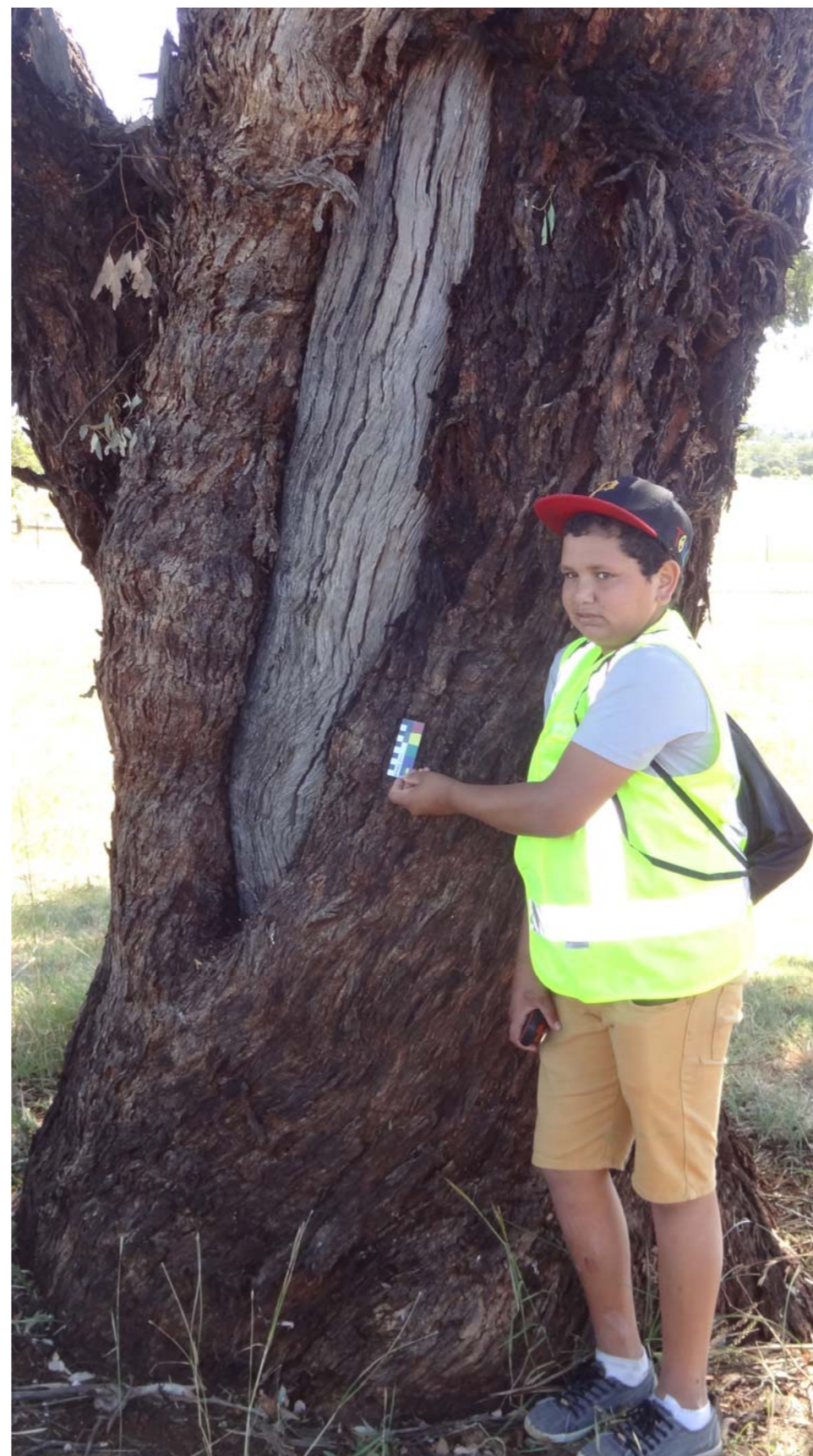
A young Murri boy helps in the measurement of a scar tree on TLC site