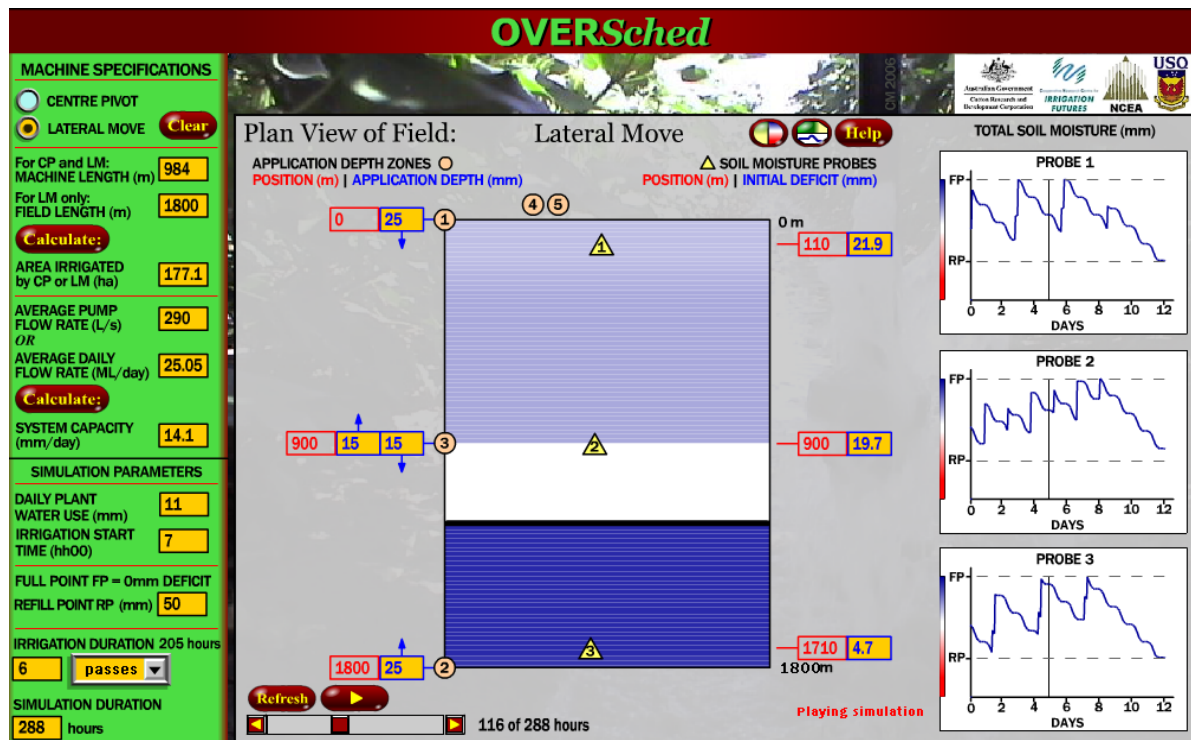
Figure 2. Graphical interface of the web-based CP&LM management tool OVERSched showing system capacity calculator on the left, with the lateral move irrigator graphic and the three corresponding moisture probe outputs on the right hand side.

The greatest management risk in converting from surface irrigation systems to CP&LM irrigation is the initial loss of crop production and profit in the first 2 to 3 years while developing a new irrigation management style. Recent developments as part of CRDC funded work on CP&LMs have included a graphical web based CP&LM irrigation simulation tool, OVERSched shown below in Figure 2.