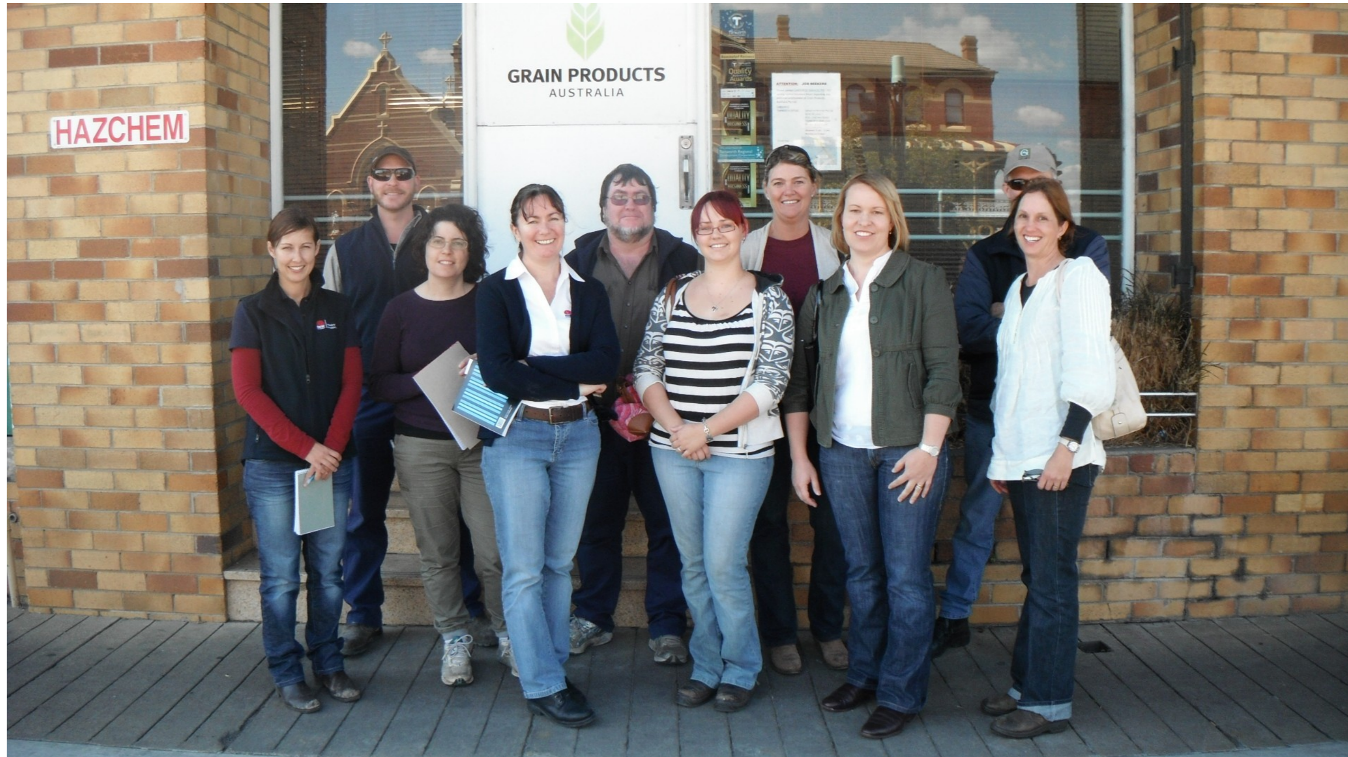
DPI Narrabri and Tamworth QA staff on a field excursion to a commercial organisation operating under ISO 9001.