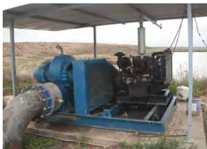
Significant cost savings as well as energy efficiency gains can be made by optimising pump performance.

It has also been found that energy use associated with picking is also significant and may contribute 20–50% of