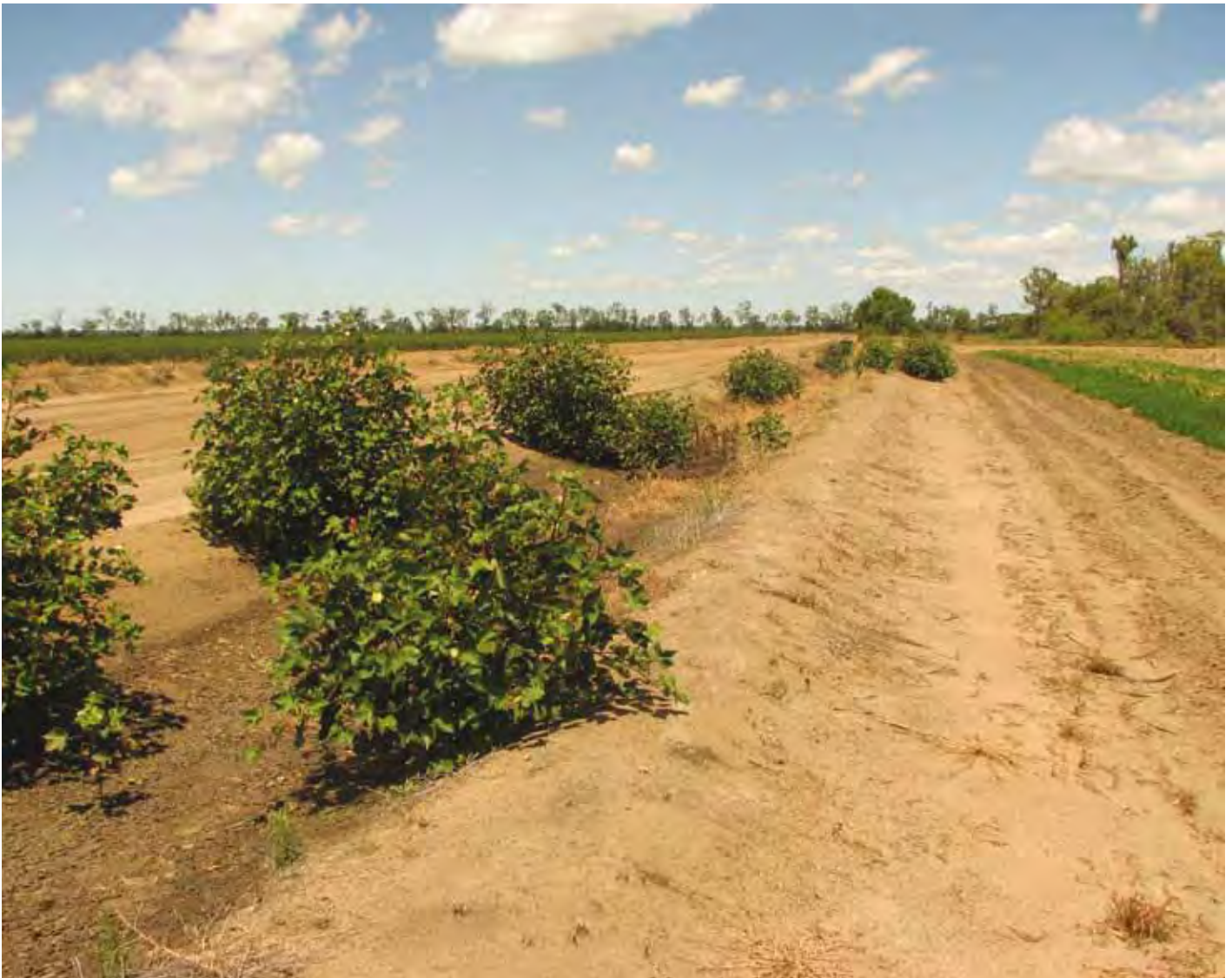
Maintain a zero tolerance for regrowth and volunteer cotton.

Options for managing cotton volunteers and ratoons are described in cotton's Weedpak.