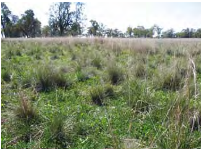
Manage grazing to preserve species diversity.

The size and configuration of native vegetation in the landscape is important. Small, isolated remnants provide 'stepping stones' across the landscape, but the most effective natural pest control is attained from well-connected areas of native vegetation located nearby the crop. Native vegetation corridors or 'bridges' between remnants facilitate the dispersal of beneficial insects through the landscape and provide local habitat when crops aren't present.