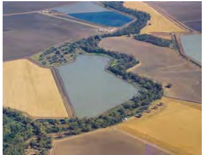
Prioritise connectivity – insects live in the landscape not on farms.

Where there is little remnant vegetation in an area, focus revegetation efforts on the creation of corridors that link areas together. Fence line plantings, wind breaks and roadside verges can provide effective habitat for beneficials and facilitate movement into and between crops. Plant species diversity and perenniality is as important in corridors as it is in larger areas of vegetation to favour predators over pests.