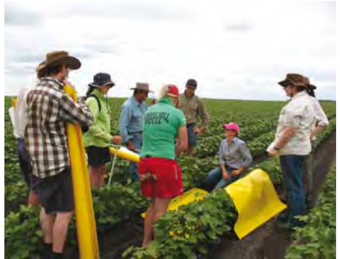
Industry training in sampling techniques is available.

It is generally not possible to make a decision about whether insect control is needed based on just one check. Good decision making requires the use of time series data so that rates of pest population development and