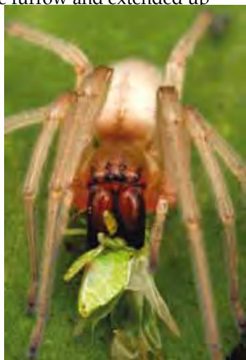
A yellow nightstalker eating a mirid.

Beat sheet sampling: A sheet of yellow canvas 1.5 m × 2 m in size is placed in the furrow and extended up and over the adjacent row of cotton. A metre stick is used to beat the plants 10 times against the beat sheet, moving from the base to the tops of the plants. Insects are dislodged from the plants onto the canvas and are quickly recorded. This method is excellent for detecting nymph and adult beetles and bugs – some of which are pests while others are beneficial.