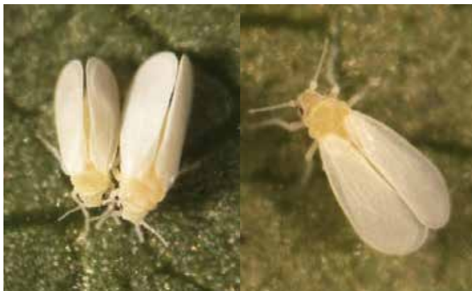
Note the gap between wings for SLW (left) compared with overlapping wings for Greenhouse whitefly (right).

Population: Once you have confirmed the presence of SLW, effective sampling is the key to successful management.