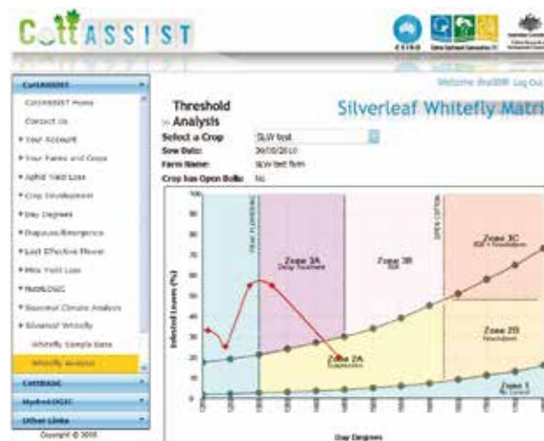
Silverleaf Whitefly Threshold tool on www.cottassist.com.au