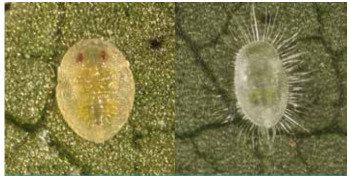
Note absence of hairs on SLW nymph (left) compared to presence on Greenhouse whitefly (right).