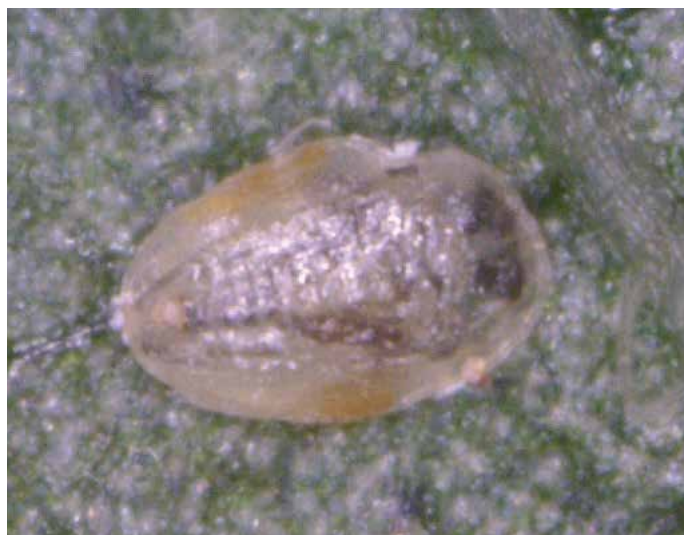
Parasitised SLW nymph. (Zara Hall, formerly Qld DAFF)

The SLW threshold matrix is designed to manage a population that builds gradually in the crop and hence follows a predictable growth trajectory. Large populations of adult silverleaf whitefly migrating into cotton crops will therefore reduce the reliability of the threshold matrix. This can occur if SLW adults leave crops that have been defoliated and seek new hosts. Decisions for management need to consider time of season, time to defoliation and evidence of honeydew. If the crop is maturing early in warmer conditions that the chance that eggs laid by immigrating whitefly will develop into nymph populations that could contaminate lint is high, where as if the crop is maturing later, when it is cooler this is less likely. Similarly, the closer to defoliation that the influx occurs the lower risk that a nymph population will have time to develop. Finally, honeydew on leaves is a good indicator of potential lint contamination. Once there is significant honeydew on lower leaves some remedial action should be taken to prevent contamination of bolls. In the worst case scenario, where cotton lint has been contaminated with honeydew, delaying harvest may assist in breaking down honeydew or expose the crop to rainfall that will remove most of the honeydew. However, if conditions remain dry reduction in the amount of honeydew on bolls will be slow, and there is a risk that contaminated cotton may still have sufficient honeydew to result in substantial penalties if harvested.