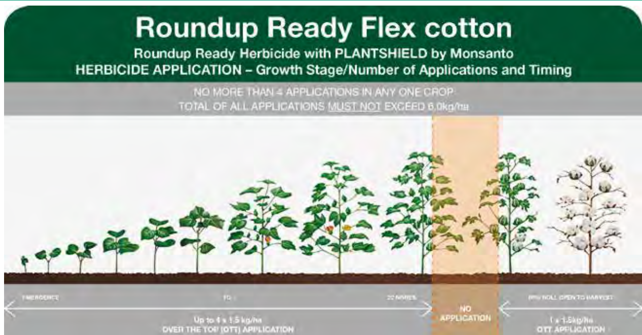
FIGURE A: Roundup Ready Flex cotton allows you to spray Roundup Ready® herbicide with PLANTSHIELD by Monsanto over the top (OTT) of your cotton from emergence through to 22 nodes.

It is a requirement of the Technology User Agreement (TUA) that growers sign annually that all persons growing and managing Roundup Ready Flex cotton crops comply with the Crop Management Plan (CMP). Within the CMP, there are the requirements for a Planting Audit and a Weed Management Post Spray Survey.