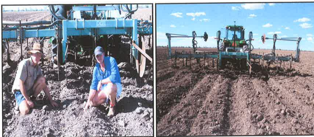
Local grower developing the new version of 2 metre beds.

The Soil Health Workshops: have also changed the mindset of many growers convincing them to change their farming practices so as to reduce tillage and compaction. 5 growers farming just over 4600ha have since converted to 2 metre beds with a variation on the old 2 metre bed system. The new system utilizes GPS technology and has the tractor and depth wheels of the equipment on top of the bed leaving all the furrows with no traffic. This has then allowed for better infiltration of irrigation water as none of the sides of the beds have been compacted whilst also resulting in a more even outflow of the furrows. Because the water emerges from all of the rows evenly has meant a reduction in tail water pumping as there are no “wheel track” rows racing through early.