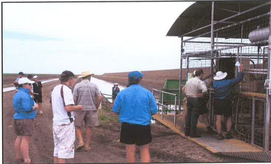
Pump Efficiency Workshop conducted at Kia-Ora near St George.

remaining 15 pumps. The calculated fuel savings alone totalled $26,000 if this particular storage was to be filled during a flood harvesting event. Obviously over a farm of this size the savings in fuel and as such carbon output is massive.