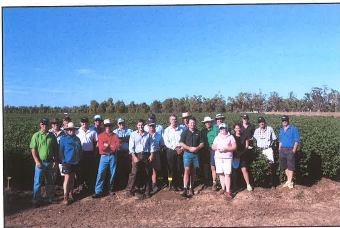
Dirranbandi & St George growers on the Farm Tour which incorporated Auscott, ACRI and the Keytah "Big Day Out".

The Auscott & ACRI Grower Tour 2009. This tour was conducted during late February and coincided with the Keytah "Big Day Out". The response from growers to this trip was and continues to be extremely rewarding. The tour was coordinated in conjunction with both the St George & Dirranbandi Cotton Grower Associations and had 8 growers from the Dirranbandi region and 13 growers from St George attend.