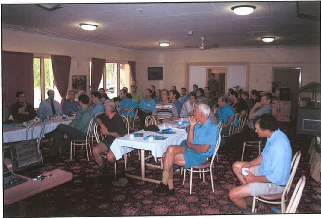
Alternative Crop meetings held at St George & Dirranbandi in December 2007 with a range of researchers.