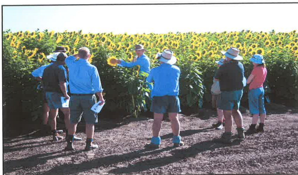
One of the many Area Wide Management IPM meetings held at Dirranbandi

Area Wide Management meetings remain one of the most valuable tools Extension Officers have of being able to communicate effectively with both local growers and consultants. In the case of St George and Dirranbandi these have been extremely well supported due to a number of factors including IPM for Whitefly and the pests produced by alternative crops such as Sunflowers, Soybeans, Corn and sorghum. These meetings have also allowed for the exchange of ideas between growers as they are normally held late afternoon at a field with a few beers. Other growers have taken away ideas such as the 2 metre bed system etc to trial on their own farms.