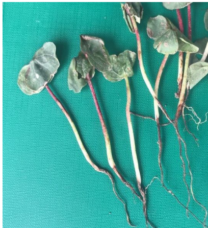
Photo 2. Seedlings from Pivot 11.

The next set of soil testing was done post cotton planting on the 1 st of December 2017 the BRR spore load had increased from 65 spores/g to 460 spores/g. This was considered a very high reading and report stated that “the BRR colonies in the soil varied from 320 colonies to 700, indicating patchiness of the inoculum” It also states that “the potential for disease in this soil is likely to be very high”.