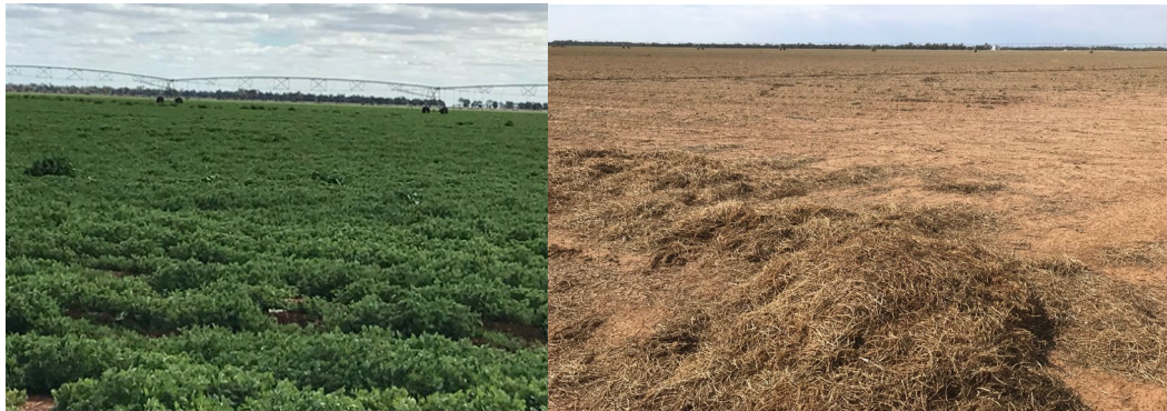
Photo 1: Vetch crop growing on left and the crop sprayed out and raked on right

sprayed out and dragged onto the edge of the field, thus not effectively fumigating the fungus in the soil (see Photo 1).