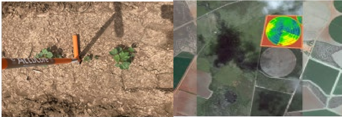
Photo 3. Left: Stunted growth 1st December. Right: NDVI on 16th Jan 2108

The crop showed variable growth through the season due to poor establishment and incidence of disease. This can be seen in Photo 3 on the right-hand side. Note there is an obvious quadrant of the pivot where Pidgeon peas were grown. The grower has indicated that the pivot yielded 2 to 2.5 bales/ha lower than other pivots with low BRR levels. The grower still sees benefit in including vetch in the rotation but will not incorporate the vetch