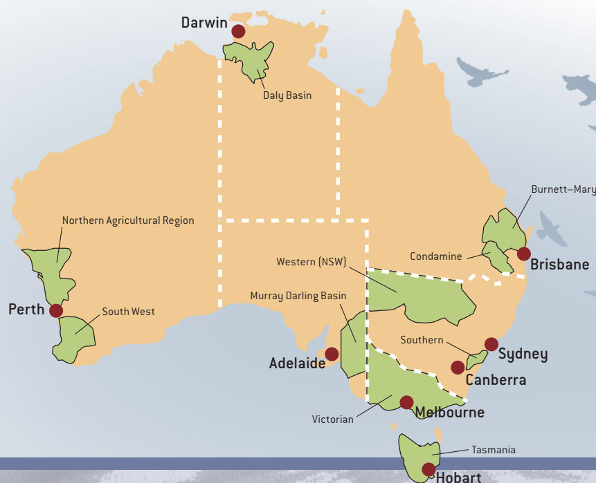
Location of trial regions.