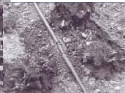
Laying of buried drip tape on the surface of raised vegetable beds, Santa Maria, California.