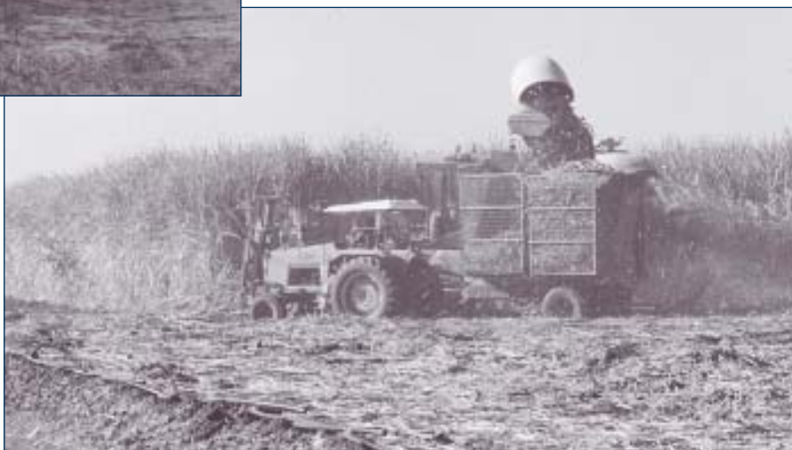
Sugar cane is a major industry in the Ord

and pay an 80c a ML levy to a fund specifically for the purpose.