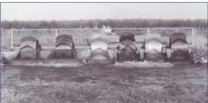
This number of dethridge wheels is an unusual sight on any irrigation scheme.

Irrigators have recognised the importance of R&D